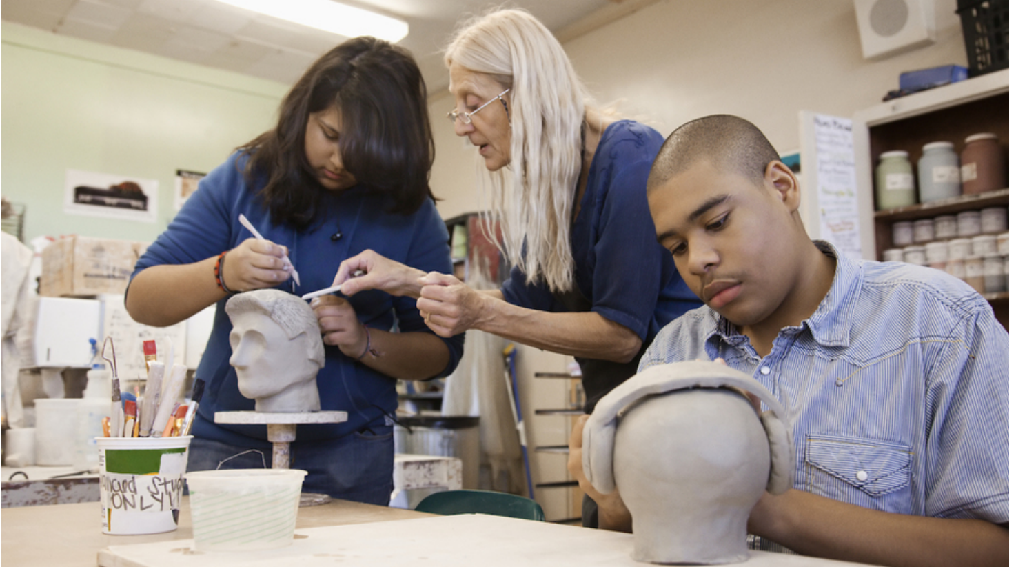
Image 1. Students sculpt with clay in an art class. Studies have shown that making art can be a way to relieve stress and anxiety.

What can you do to help relieve feelings of stress and anxiety? If you're an artist, you keep making art. And if you have never considered yourself an artist, now is the time to take up an artistic pursuit such as drawing or painting. It is never too late to start. Everyone can do it. If you can hold a brush or crayon or marker, you can create art.